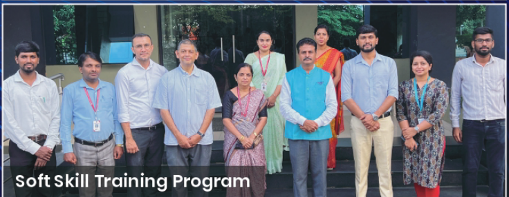
Soft Skill Training Program