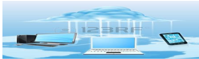
Figure 1. A Cloud Computing Scenario

connected to the Internet. These devices submit their request and receive the response without any delay [3]. Figure 1, it shows different devices (mobiles, PCs, laptops) connect and access the data from a cloud at any given time.