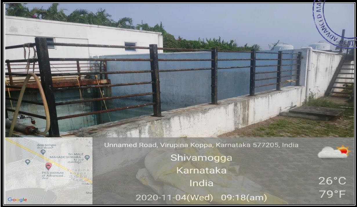
Fig3: Sewage Treatment Plant Walls