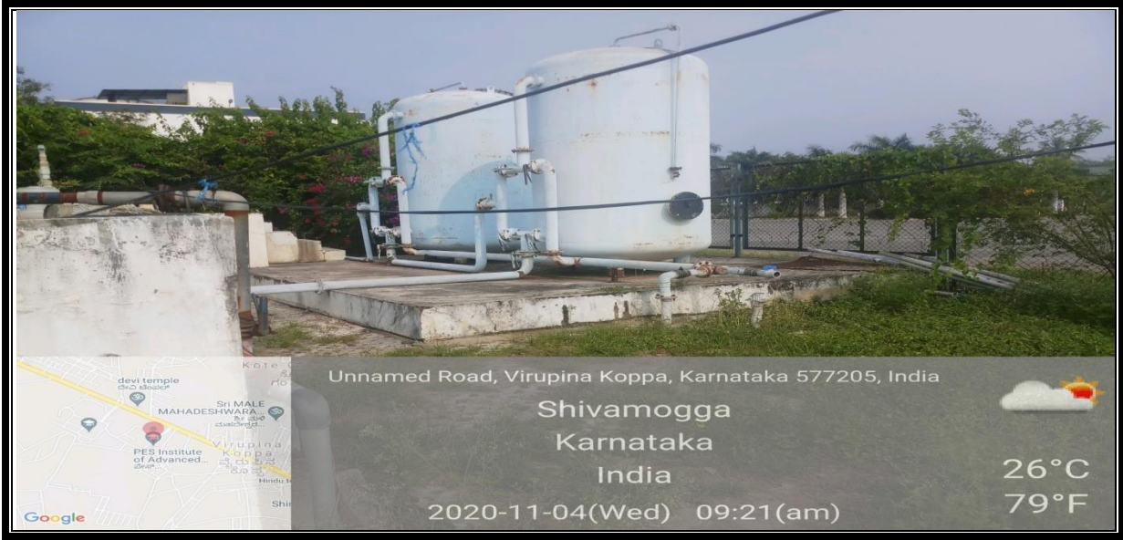
Fig1: Sewage Treatment Plant Tanks