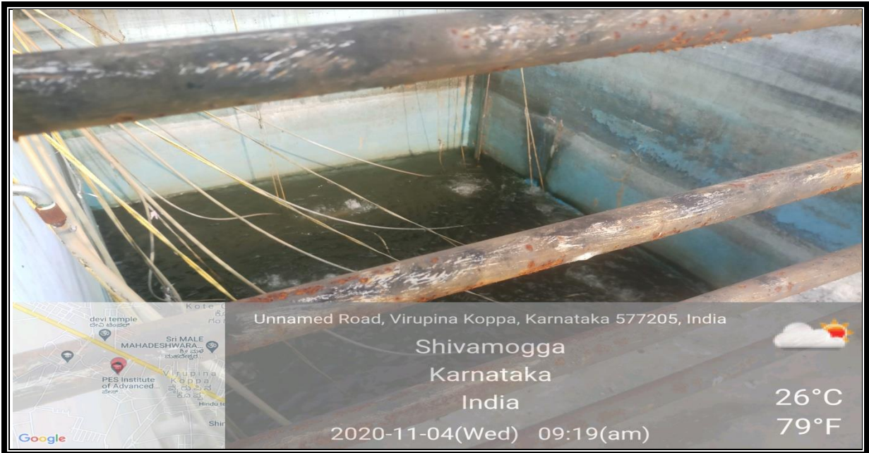
Fig2: Sewage Treatment Plant Aeration Tank