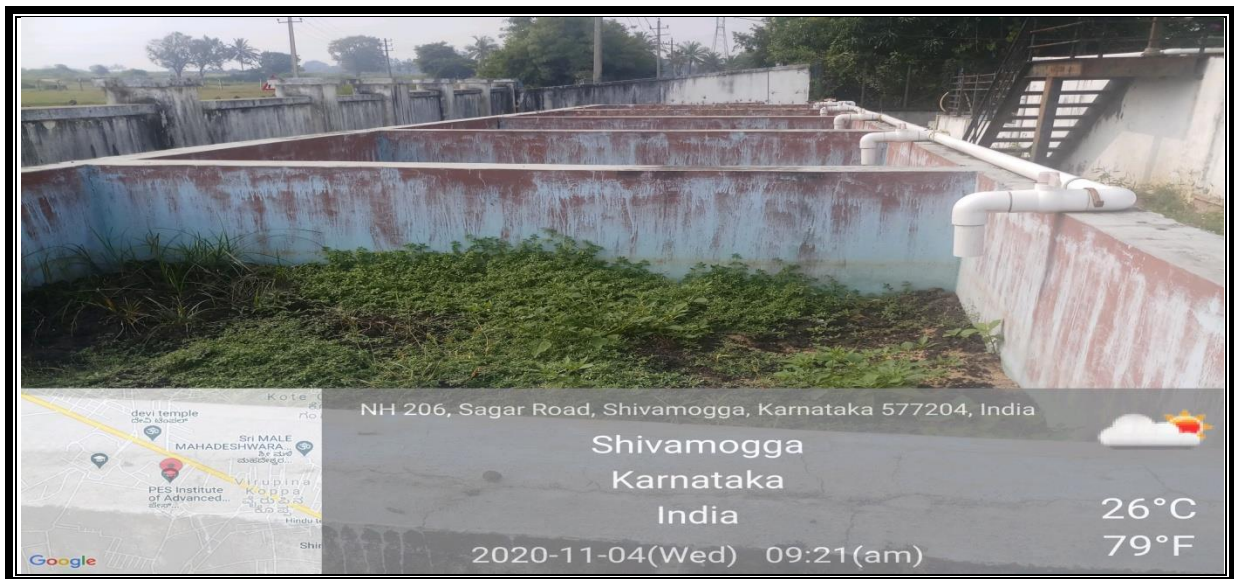
Fig6: Sewage Treatment Plant Settling Tank