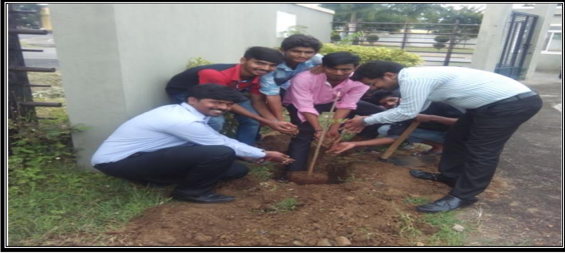
Fig1: Tree Plantation in College Campus