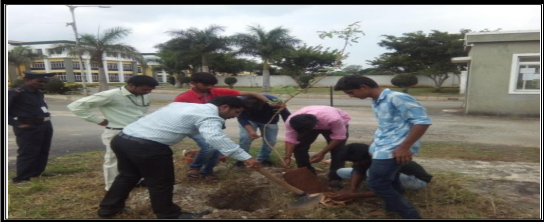
Fig2: Tree Plantation in College Campus

NSS forum of PES Institute of Advanced Management Studies had organized a “ Tree Plantation Program ” in the college campus at 07/10/2017. The program was initiated to create the awareness of environment.