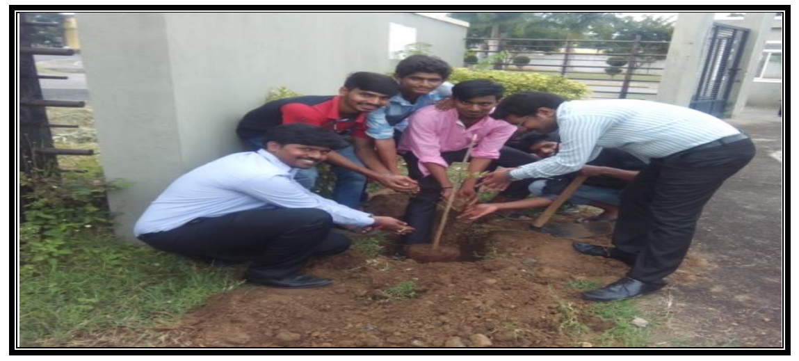
Fig1: Tree Plantation in College Campus