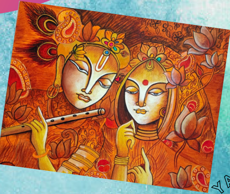
Painting By YASHWI JRAI 3RD SEM