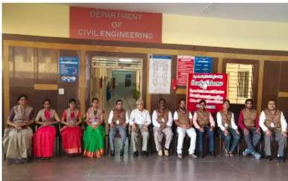
NBA Expert Committee Visit on 23/10/2021

Established in the year 2013, Department of Civil Engineering has qualified and experienced faculties from academic and industrial background. The Department has state of art laboratory and computing facilities and strives for imparting knowledge and skill through academic excellence and organising developmental activities for students and staff.