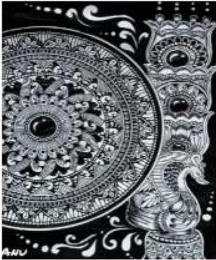
Pencil Sketch by Anushree, 5th Semester