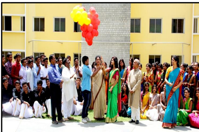
Inauguration of Ethnic Day