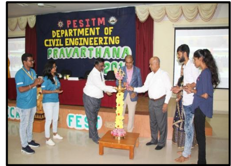
Inauguration of Technical Fest