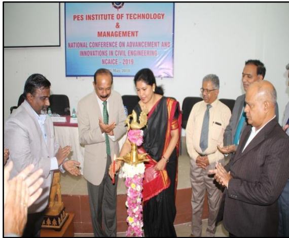
Inaugural Function of National Conference on Advancement and Innovations in Civil Engineering