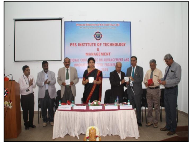
Release of National Conference Proceedings By the Dignitaries