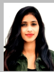
Bhoomiks SM 4PM18EE004