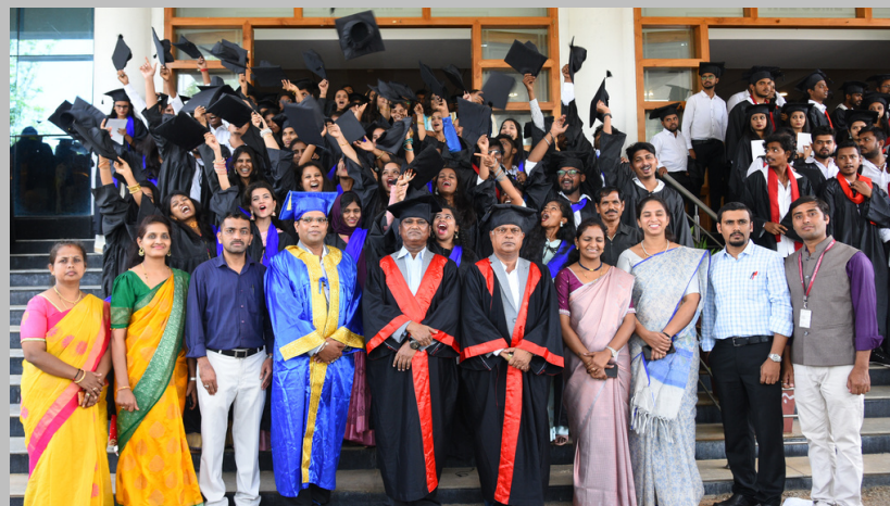
Graduation day Celebration on 7th May 2022.