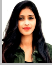
Bhoomiks SM 4PM18EE004