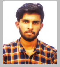
Shivaganga L 4PM19EE434