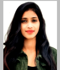
Bhoomiks SM 4PM18EE004