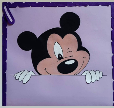
Shreenitha N Raj 4PM19EE031