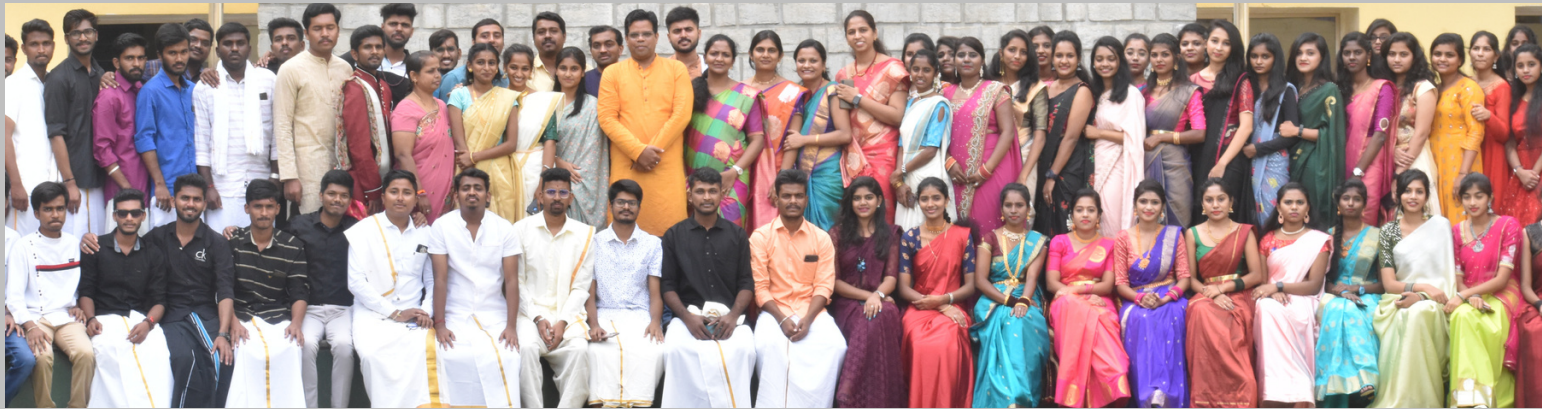
Ethnic Day Celebration on 1st Jan 2022.