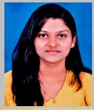
Mandara BC 4PM18EE009