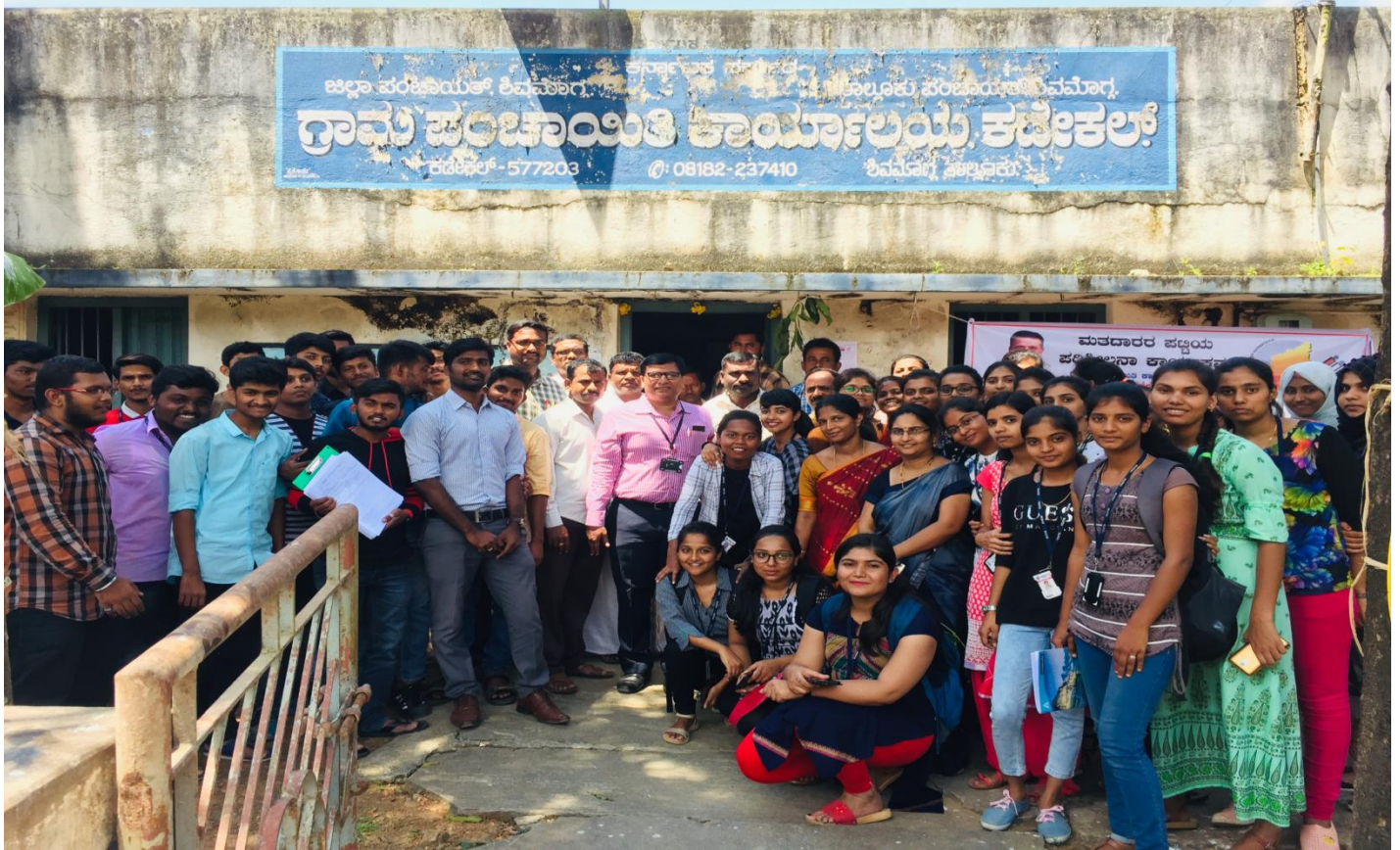
Unnat Bharth Abhiyan