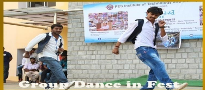
Group Dance in Fest