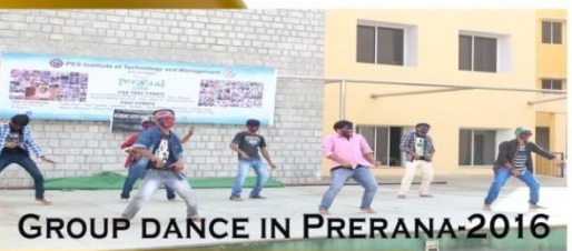
GROUP DANCE IN PRERANA-2016