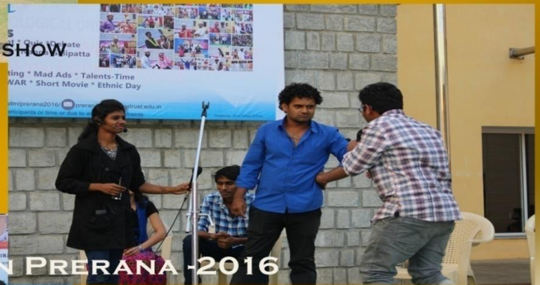
SKIT IN PRERANA -2016