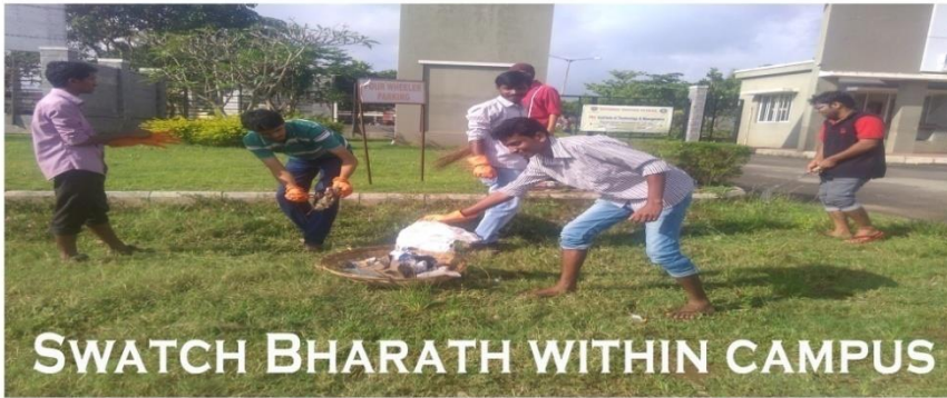
SWACHH BHARATH WITHIN CAMPUS