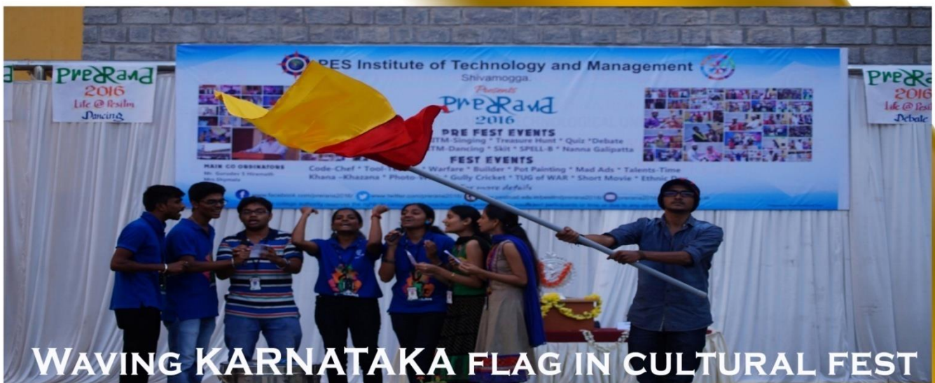
WAVING KARNATAKA FLAG IN CULTURAL FEST