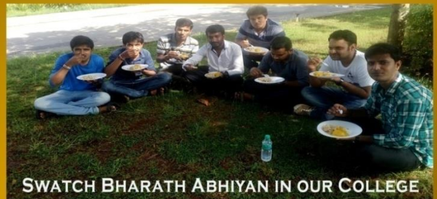
SWACHH BHARATH ABHIYAN IN OUR COLLEGE