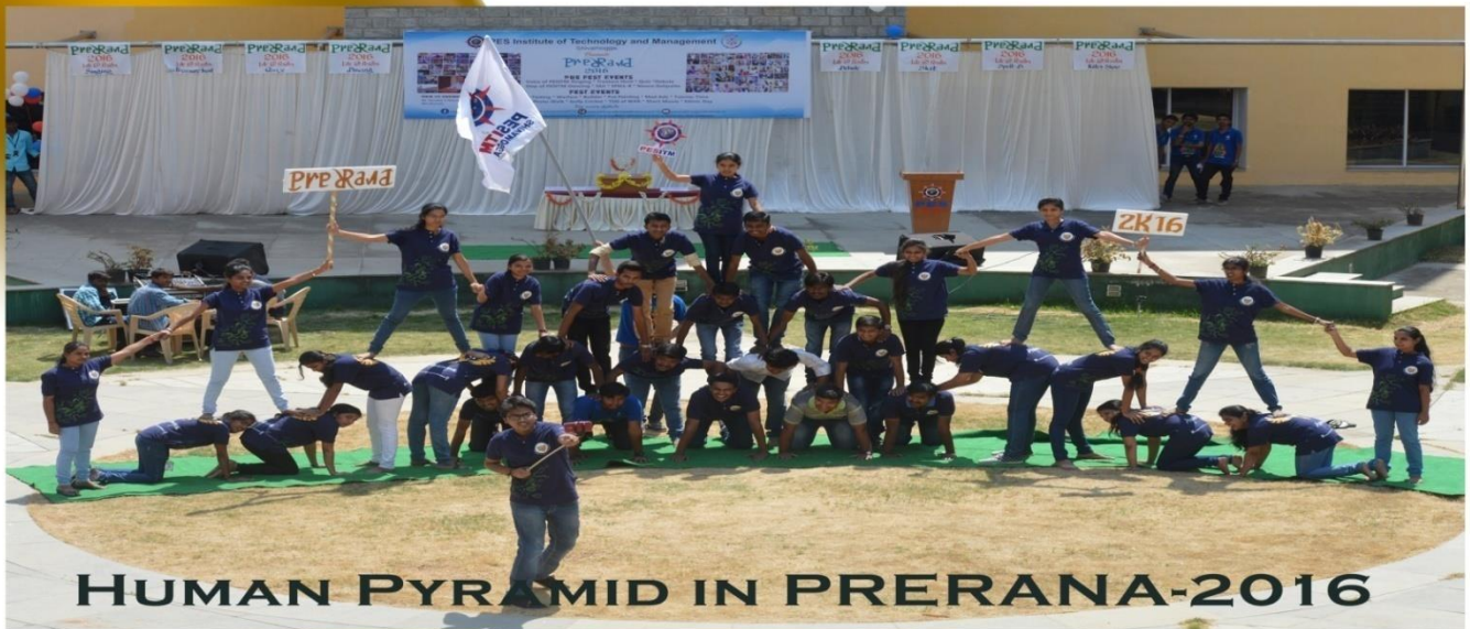
HUMAN PYRAMID IN PRERANA-2016