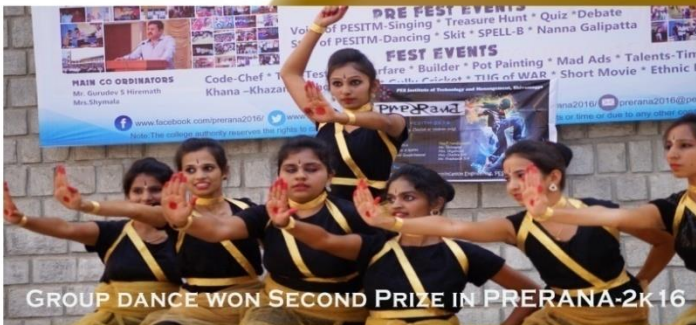
GROUP DANCE WON SECOND PRIZE IN PRERANA-2K16