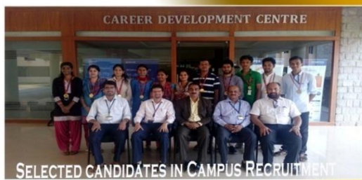
SELECTED CANDIDATES IN CAMPUS RECRUITMENT