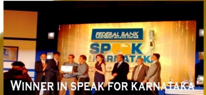
WINNER IN SPEAK FOR KARNATAKA