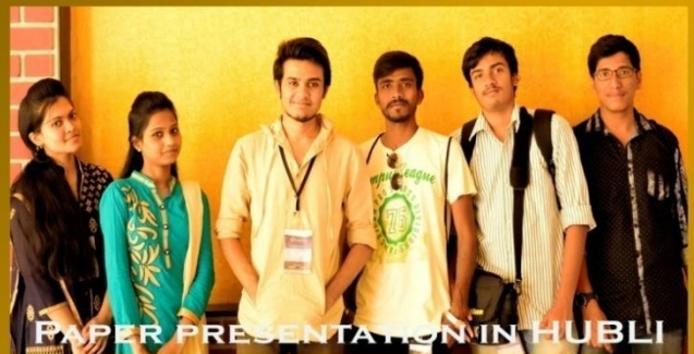
PAPER PRESENTATION IN HUBLI