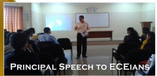
PRINCIPAL SPEECH TO ECEIANS