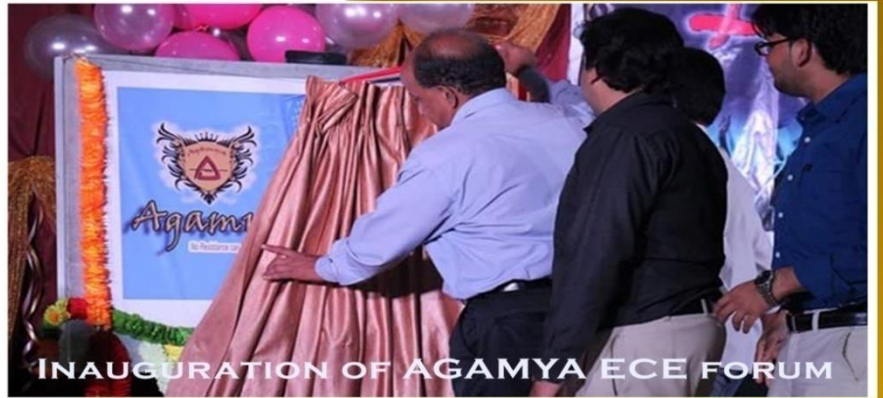
INAUGURATION OF AGAMYA ECE FORUM