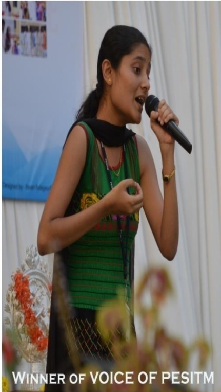
WINNER OF VOICE OF PESITM