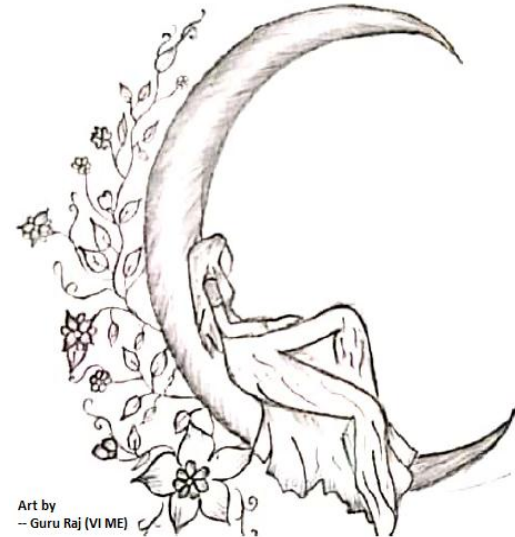
Art by -- Guru Raj (VI ME)

Get into pain when there is no rain Until it rain enjoy the pain The pain that rained seems to be ruined But the rain from the pain Is the destiny of success.