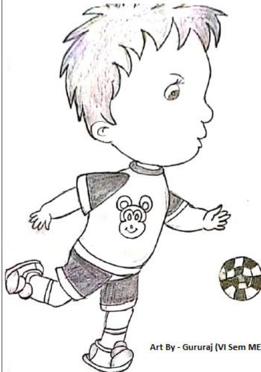
Art By - Gururaj (VI Sem ME)