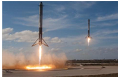
Space X falcon heavy

On 6 February 2018 Elon musk's space x has launched falcon heavy reusable rocket, which will also significantly reduce the cost of each launch, other major players includes united launch alliance, blue origin and virgin galactic by Richard Bronson even after all advancement in global startups in private sector one organization in public sector giving serious competition to all the companies. That is our beloved ISRO and its launch vehicle PSLV, PSLV is known as the most reliable launch vehicle in entire world and also provides service at lowest cost, American startups are lobbying to American government not to use PSLV for their missions instead use there launchers due to all these reasons it's important for Indian private sector to join global race so that India stays on top , and it will relieve ISRO from commercial activities so that it can concentrate on crucial R&D activities. But currently commercial space activity is regulated. Due restriction from Indian government but the good news is government is likely to introduce space activity bill 2017 next year, which will open the doorway to commercial space activity in India and make India a global player in the sector.