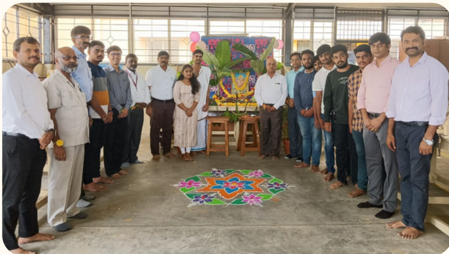
Ayudha Pooja celebration at ME Department - Machine Shop on 01.10.2022