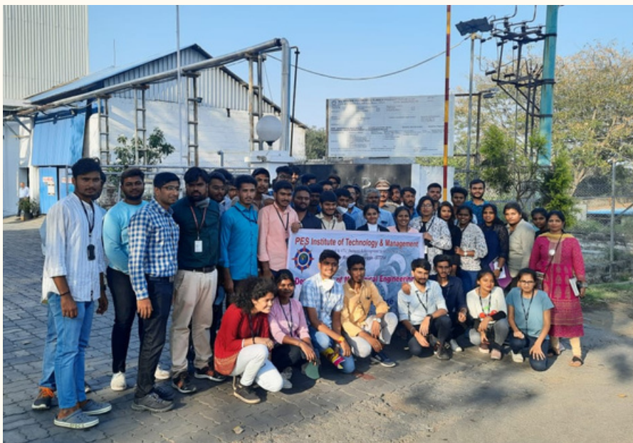
Industrial visit to MYPOL, Mysuru by 5th Sem ME Students on 09.01.2023