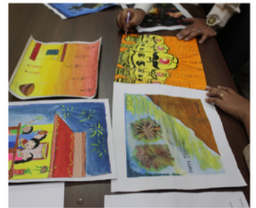
Glimpses of Inauguration and conduction of cultural activities organized under Mech-Innova forum of Mechanical Engineering Department on 21.11.2022. (1. Youth Parliament 2. On spot painting 3. Collage)