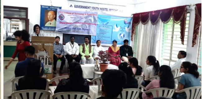
"Gift of Piece" event organized at Youth Hostel, Mysuru in Joint collaboration with Dept. of ME, PESITM, Shivamogga on 09.01.2023