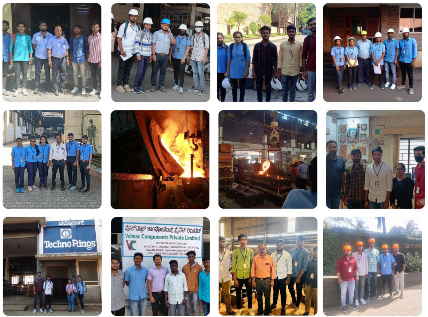
Industrial visit by 5th Sem ME Students to Industries at Machenahalli on 17.01.2023