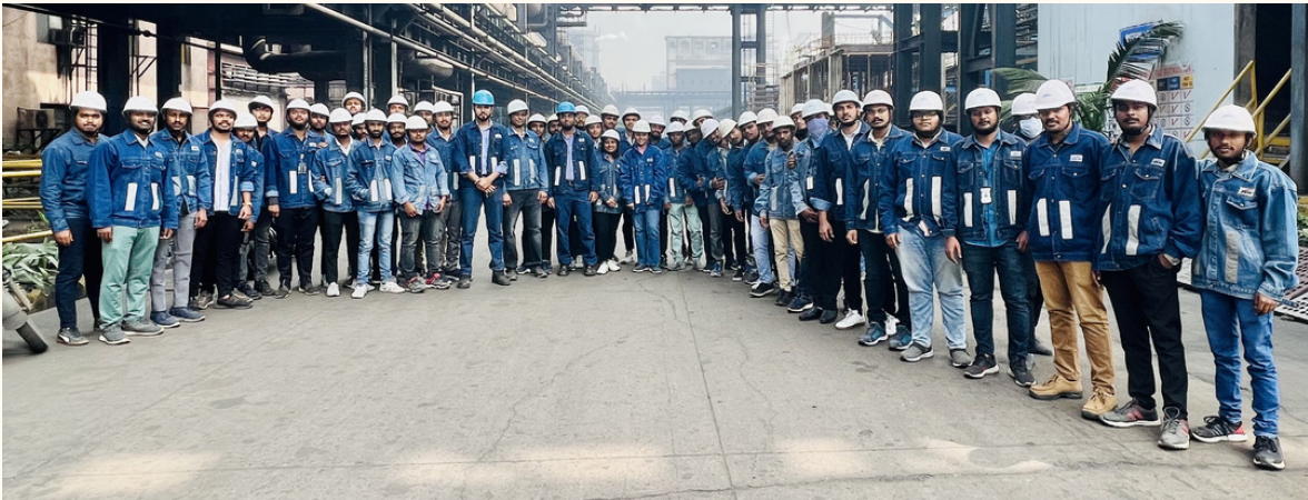
Industrial visit to JSW Steel Limited, Bellary by 7th Sem ME Students on 11.11.2022