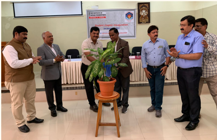
Inauguration of IIF Student Chapter, Dept of ME, PESITM on 03.11.2022