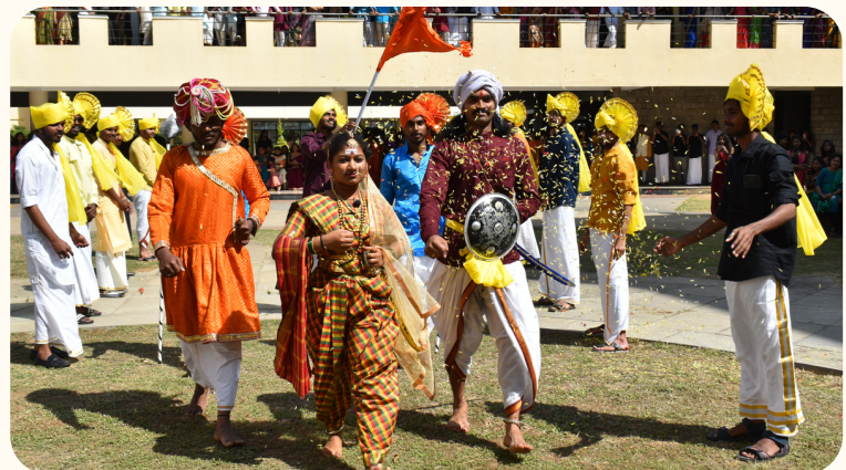
Glimpses of Ethnic day celebration by ME Dept (Theme: Kittur Karnataka) on 03.12.2022