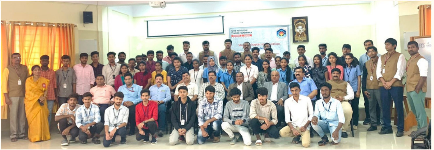
Group photo after the Inauguration of IIF Student Chapter, Dept of ME, PESITM on 03.11.2022

To emerge as a center of excellence in the field of Mechanical Engineering Education, Research and Entrepreneurship