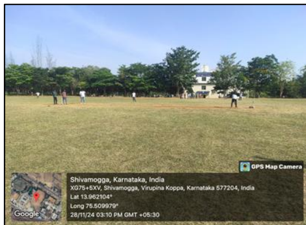
Glimpses of Cricket Tournament