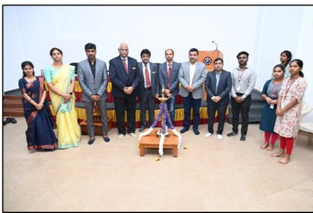
Glimpses of Inauguration of IPA Student Chapter