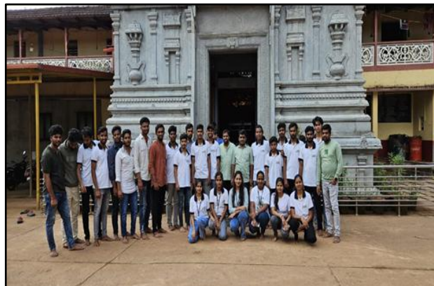
Glimpses of Industrial visit to Varahi and Mani dam