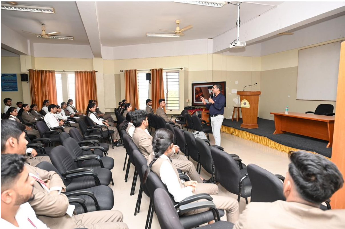
Glimpses of Talk on Think Civil, Think Big: Empower Your UPSC & KPSC Journey with Topper IAS