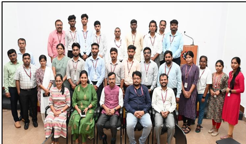
Glimpses of Campus to Corporate- Placement Preparedness Training