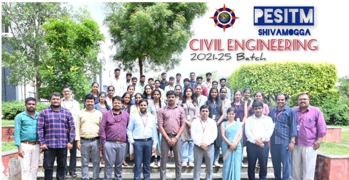
Glimpses of Alumni Batch 2021-25