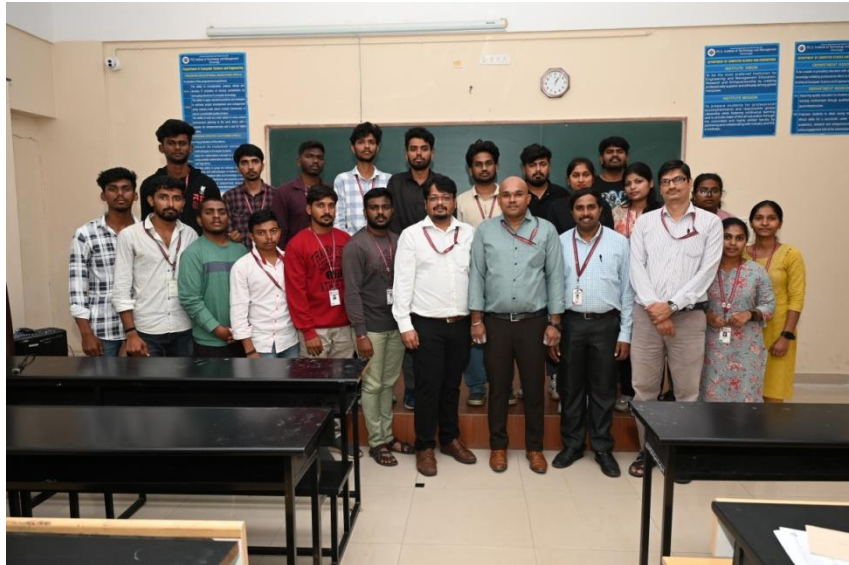
Glimpses of Employability Enhancement Programme