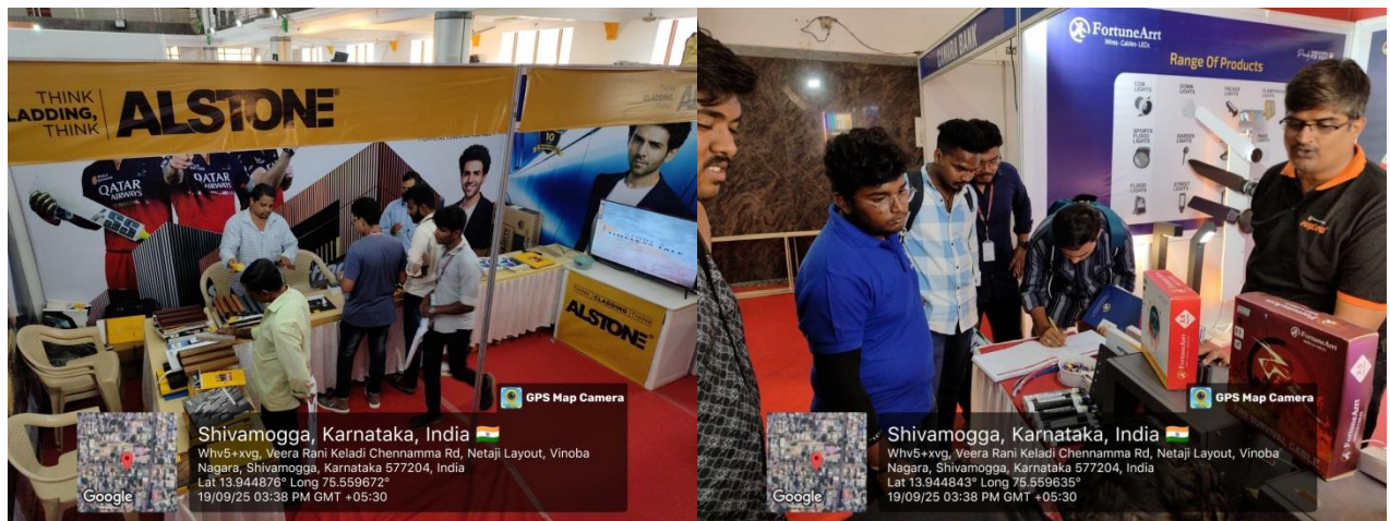
Glimpses of Session – ACEA-CON2025 Expo