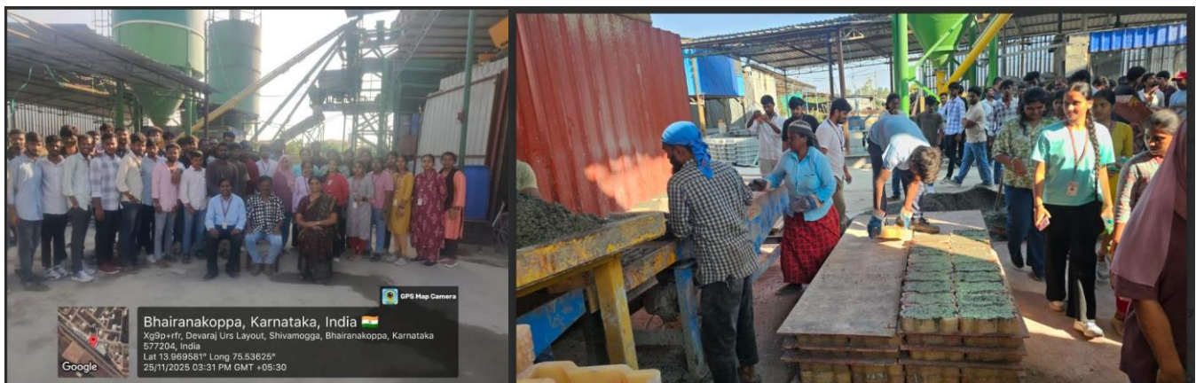
Glimpses of Site Visit - Concrete Product Industry