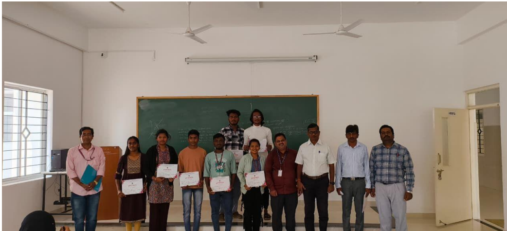
Glimpses of "Green Energy" Poster Presentation Event