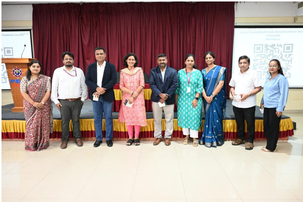
Glimpses of Session – Mind mapping & Personality