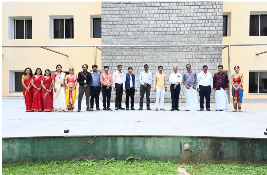
Glimpses of Ethnic Day Program