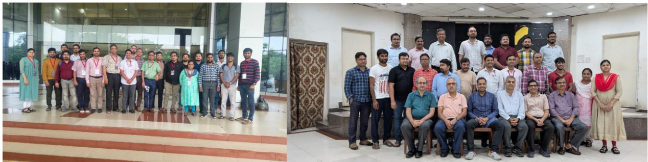
Glimpses of "CEE Program" at IIT Kharagpur