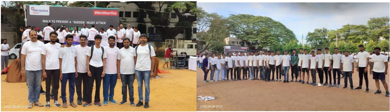
Glimpses of Students participated in the Walkathon 2025 on the occasion of World Heart Day