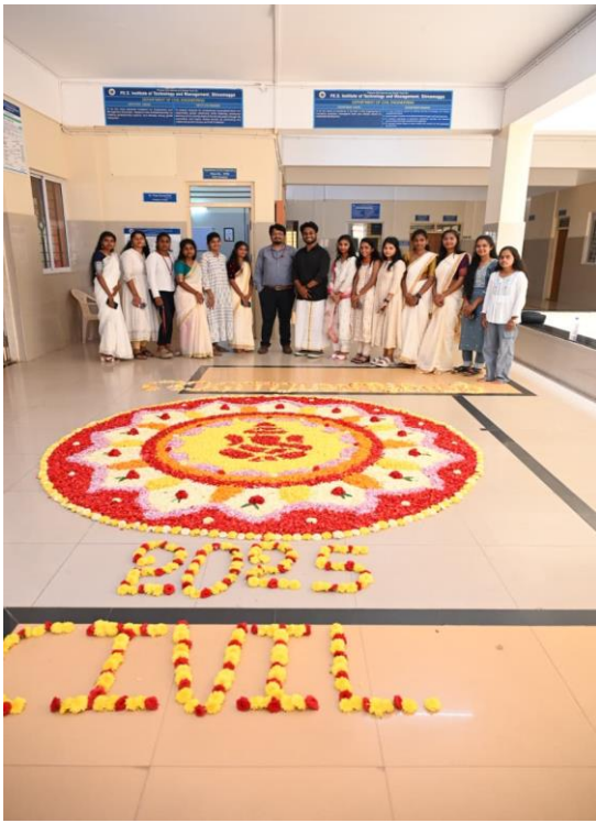
Glimpses of Floral Rangoli Competition