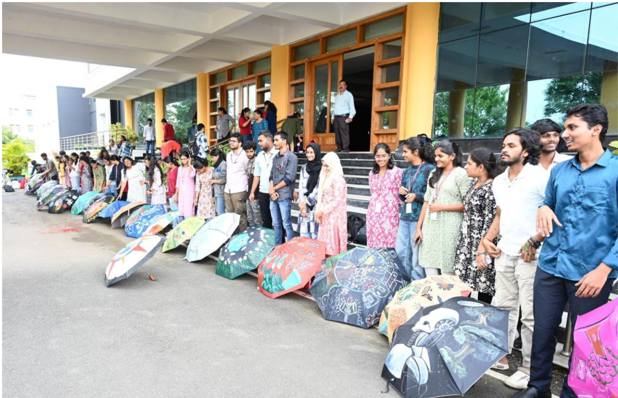
Glimpses of Umbrella Painting Competition