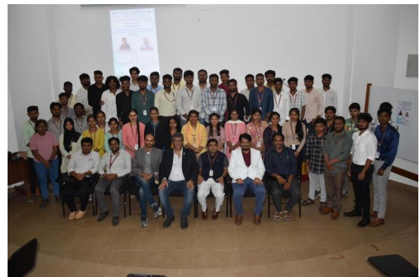
Glimpses of Technical Talk - Indian Plumbing Association