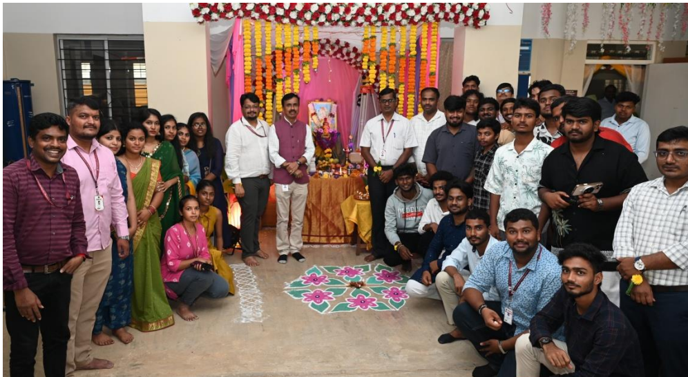
Glimpses of Ayudha Pujya at Civil Engineering Department