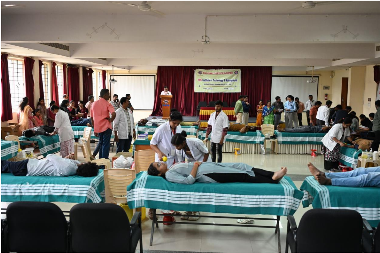
Glimpses of NSS - Blood Donation Camp