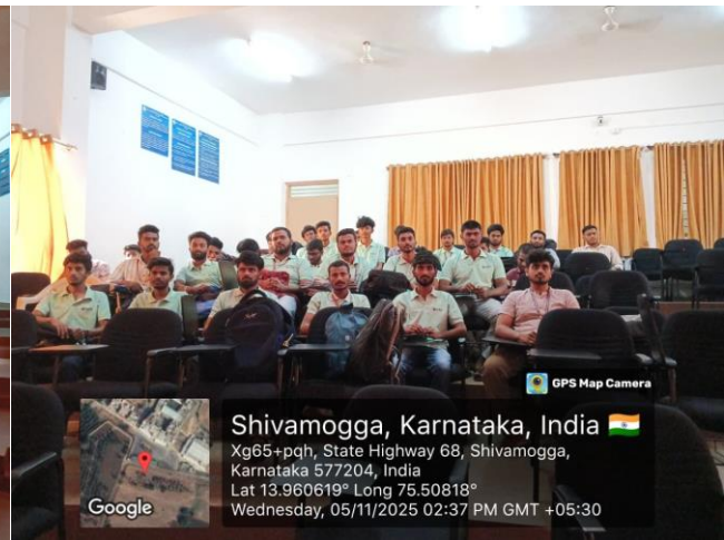
Glimpses of Webinar - Towards Sustainable Campus: Carbon Neutrality & ESG