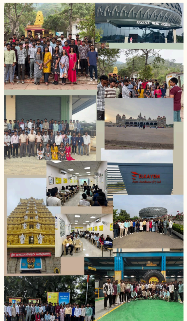
Glimpses from the industry visit, where students explored modern technologies and hands-on industrial operations.