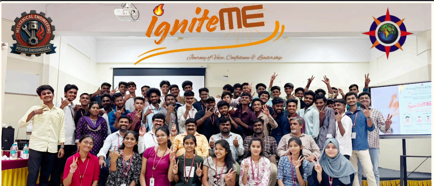
The Three-Day Skill Development Program for 3rd semester students on "Effective Public Speaking and Communication" empowered students with essential speaking, presentation, and leadership skills during sessions held from 22 nd -24 th September 2025..