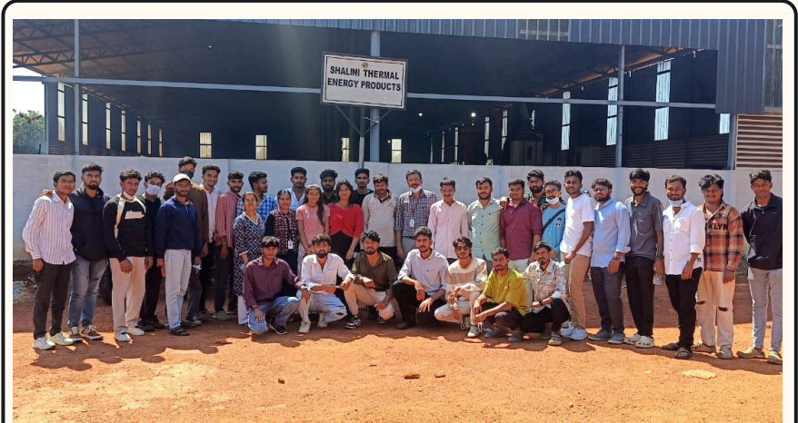
Industrial Visit to Shalini Industry 2025