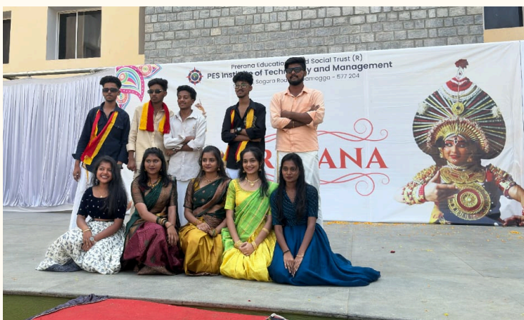
A lively stage performance by our students, reflecting their enthusiasm, teamwork, and artistic flair.