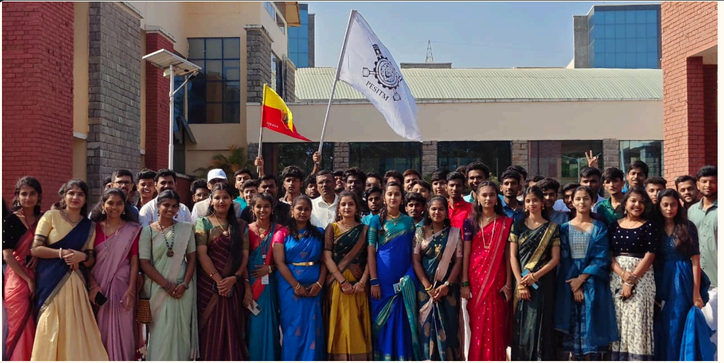
A vibrant glimpse of the Department of Mechanical Engineering during Ethnic Day, as students and faculty came together in traditional wear to celebrate culture and heritage.