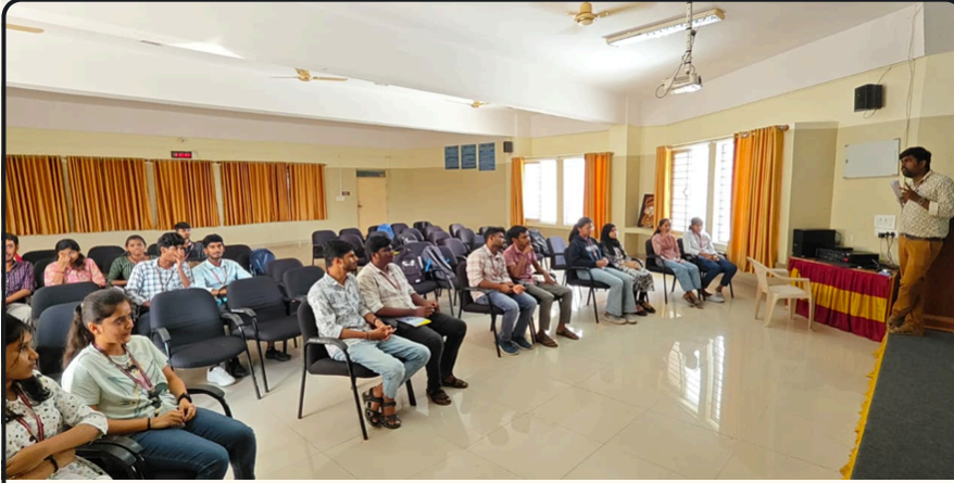
Final Round of Sir M V Quiz