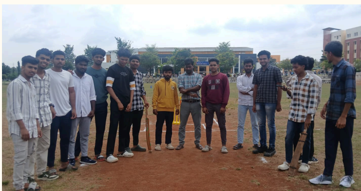
Students of the Department of Mechanical Engineering in action during the department-level cricket tournament, showcasing teamwork, sportsmanship, and competitive spirit.