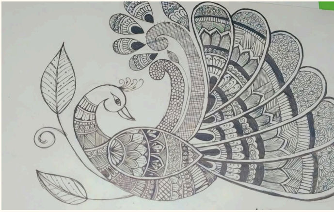
Yashaswini N B, 3 rd year student

Glimpses of artistic creations by our students, highlighting their creativity and ability to transform ideas into beautiful visual expressions.