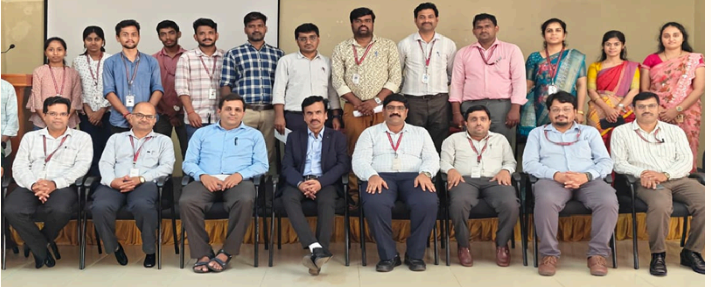
Group photo with Dignitaries, Teaching and Non-Teaching Faculty members and Students during A technical quiz on Sir. M Visvesvarayya on the occasion of Engineer's day on 17 th September at ME Seminar Hall.