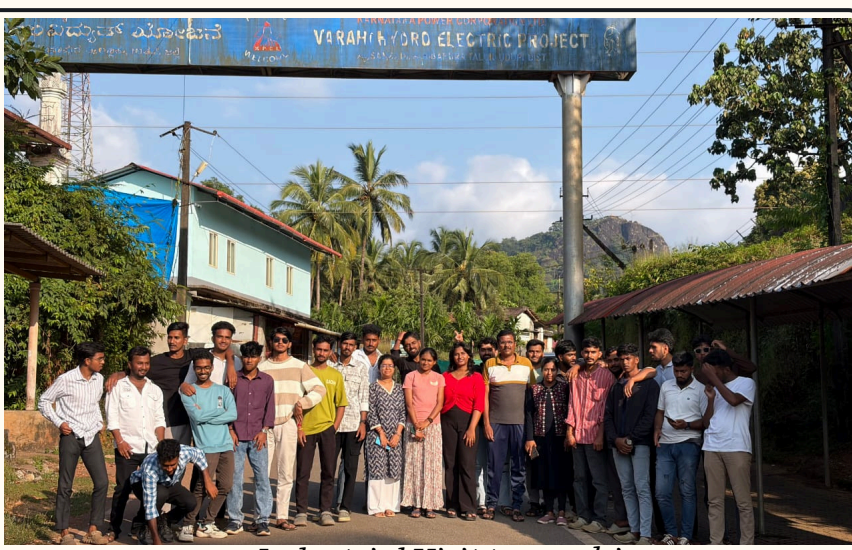
Industrial Visit to varahi