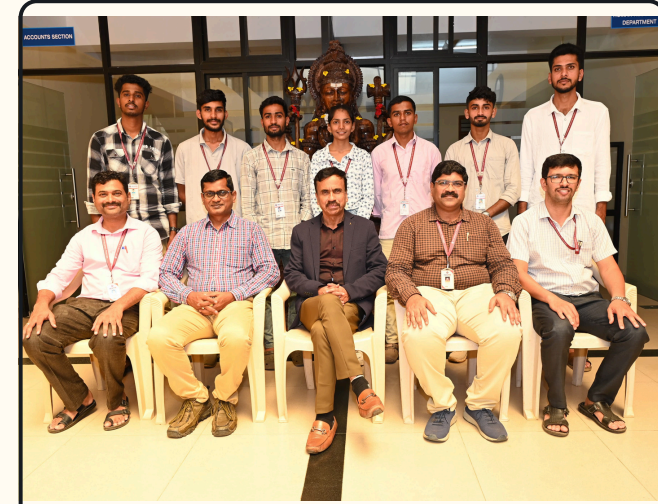
Scheme B students who went for 1 year Internship with stipend