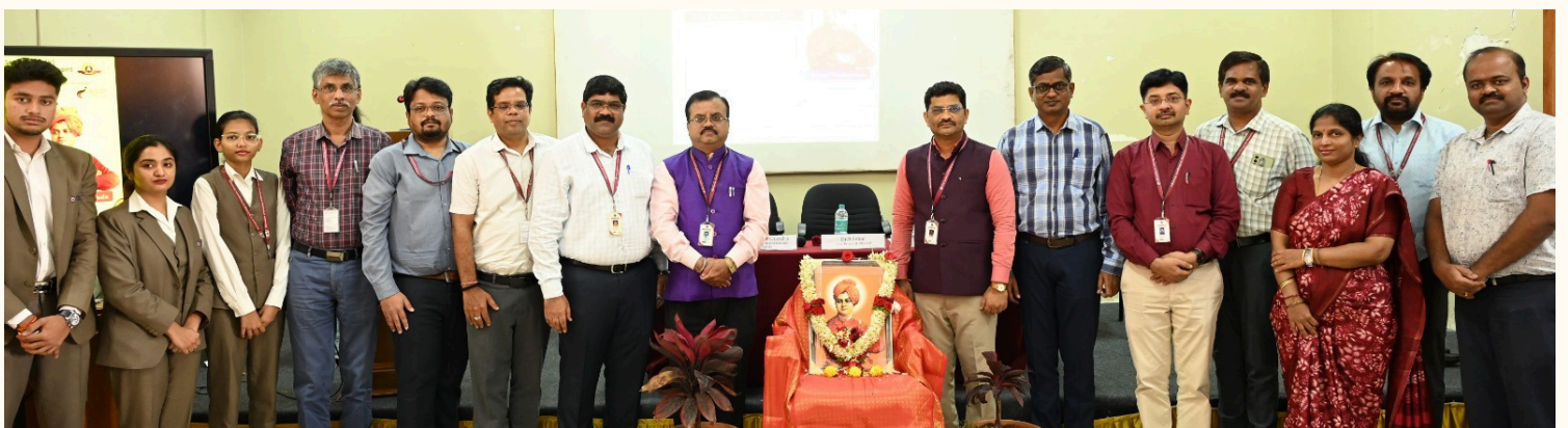
Group photo with Dignitaries, Teaching and Non-Teaching Faculty members and Students during the National Youth Day Celebration and Youth Talk Public Speaking Competition held on 12.01.2025 at MBA Seminar Hall.