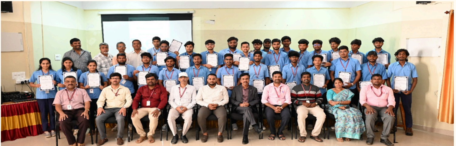
Group photo with Dignitaries, Teaching and Non-Teaching Faculty members and Students during the 3-day Skill Development Program on “CNC Programming and Operation – Hands-On Training” from 23.10.2025 to 25.10.2025 at ME Seminar Hall.

To be the most preferred destination for Mechanical Engineering education, research and entrepreneurship.