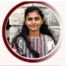
BINDU GM 4PM22EE004