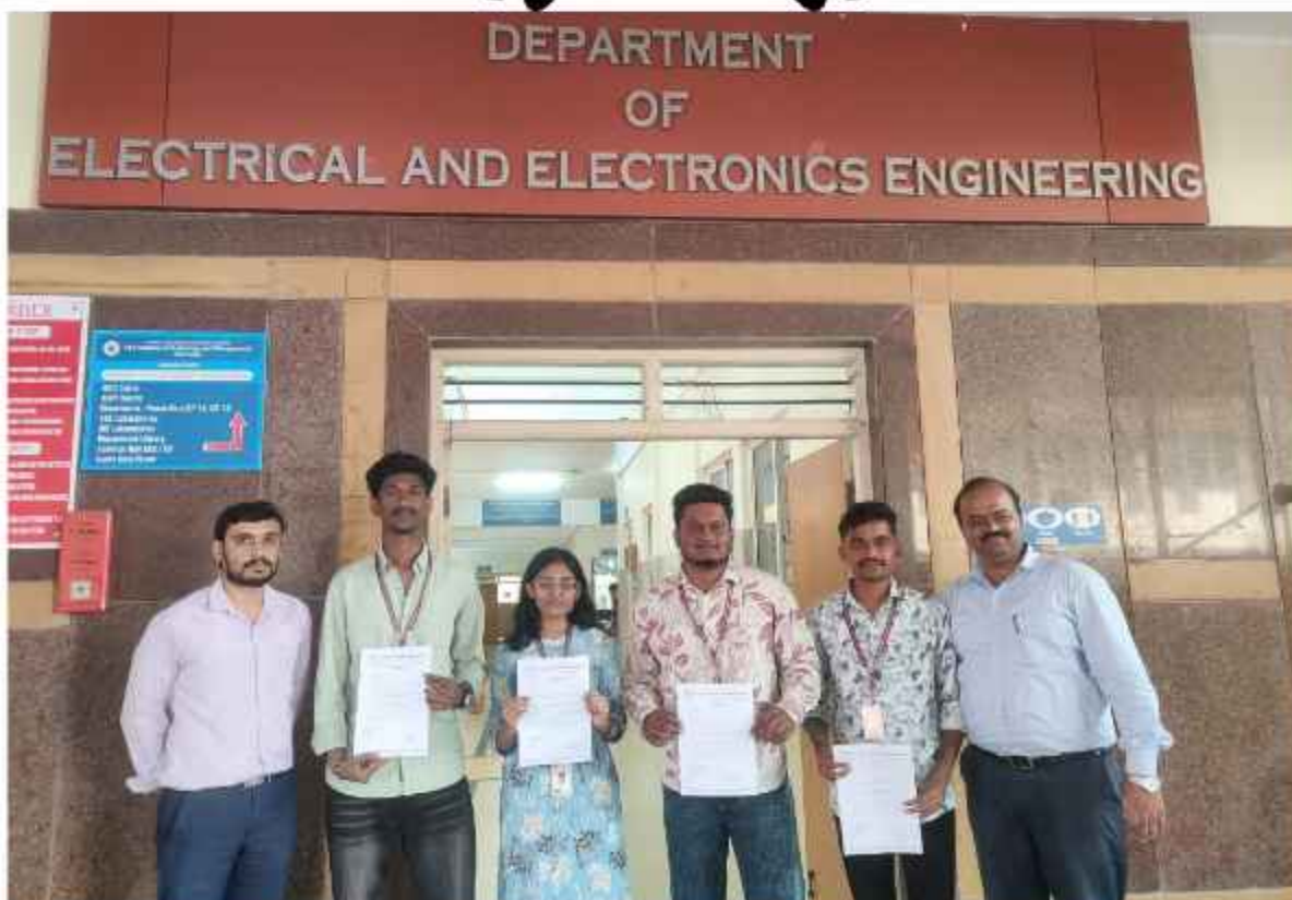
Students placed in Buhler and Schreler received their offer letters on 12th November , 2025.