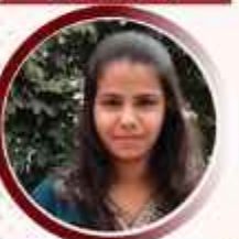
USHA T 4PM22EE037