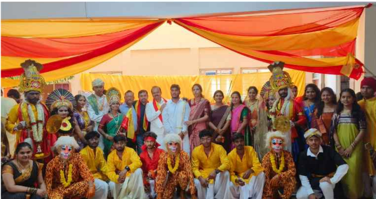
Ethnic Day was celebrated in the department on 15 th November , 2025.