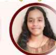
INDU R 4PM22EE014