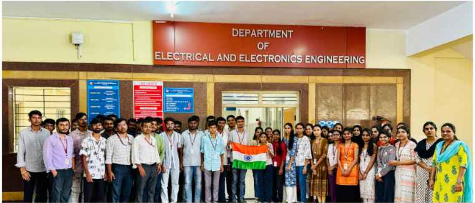
The "Har Ghar Tiranga" campaign took place in the department on 14 th August , 2025.