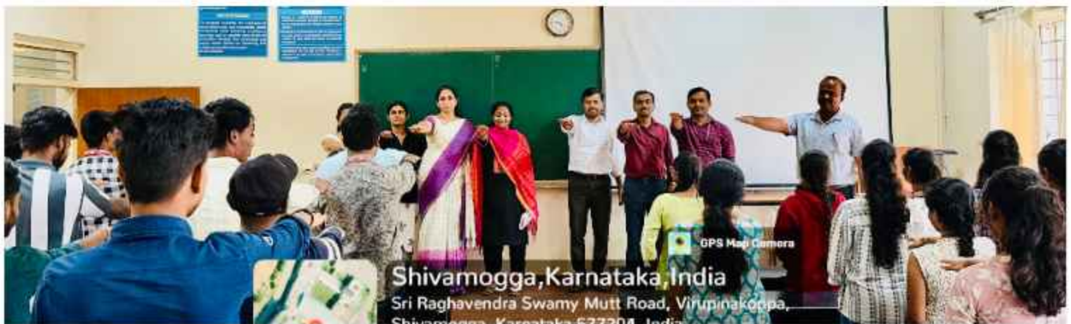
Sadbhavna Divas was commemorated in the department on 19th September , 2025.