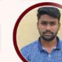
GURUNATHESHWARA M 4PM22EE012