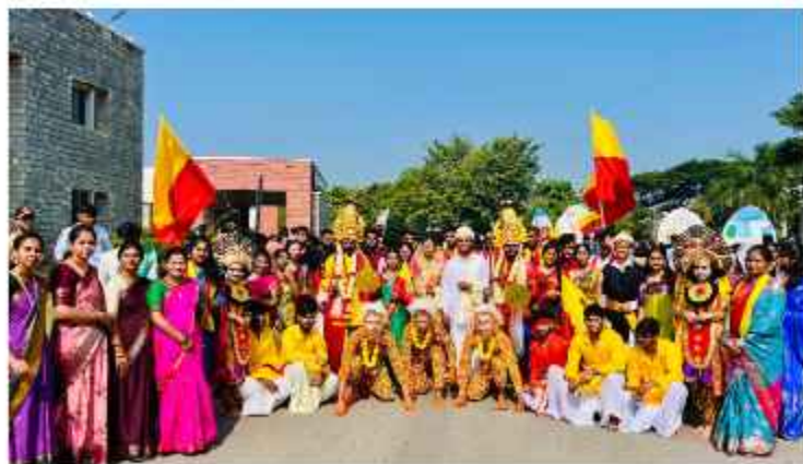
A Lively Celebration Rich in Culture and Traditions – Karnataka Vaibhava Ethnic Day on 15th November, 2025

A remarkable milestone was achieved with 100% internship-cum-placement secured for 7th semester students.