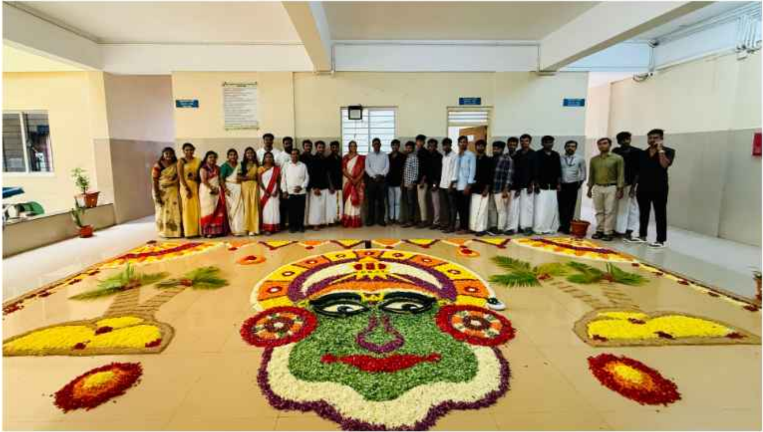
The Pookalam event took place in the department on 20 th September , 2025.