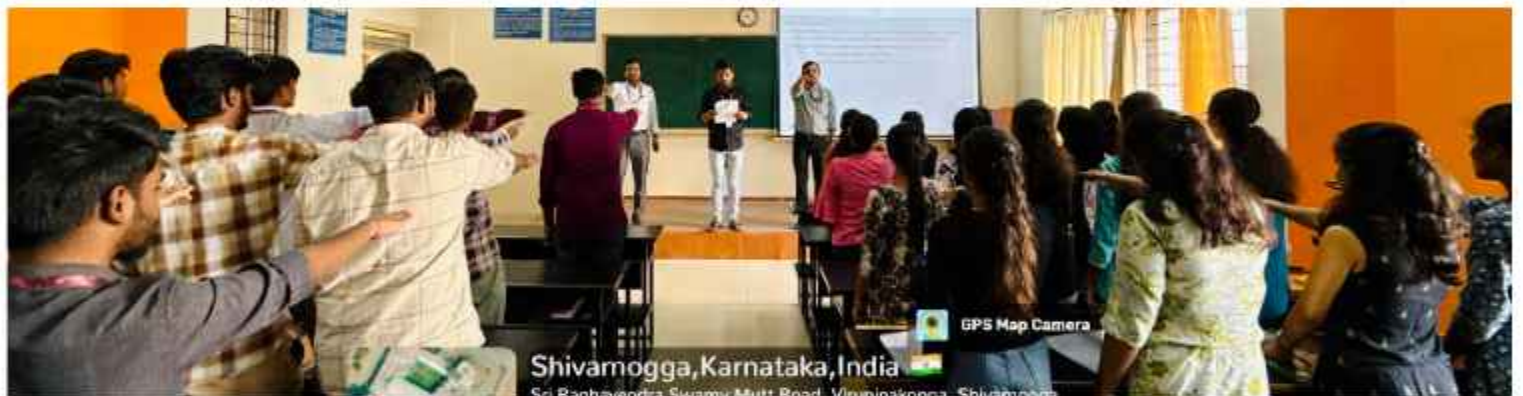
Constitution Day was celebrated in the department on 26 th November , 2025.