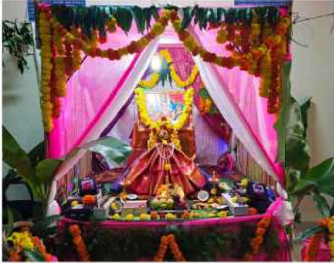
Ayudha Pooja, a Day of Gratitude for the Tools That Empower Our Work and Progress was celebrated on 30th October 2025.