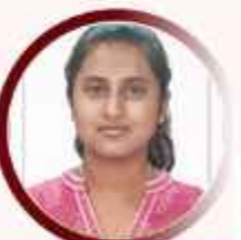
SWARNA A 4PM22EE030