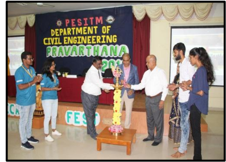
Inauguration of Technical Fest