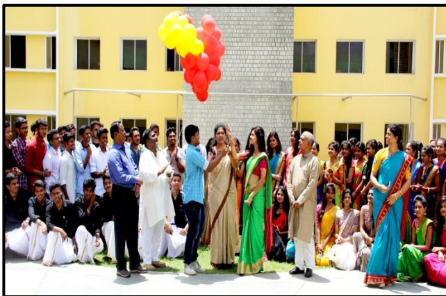
Inauguration of Ethnic Day