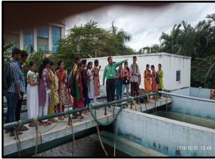
Visit to STP, PESITM