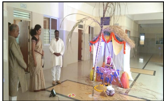
Glimpses of Ethnic Day