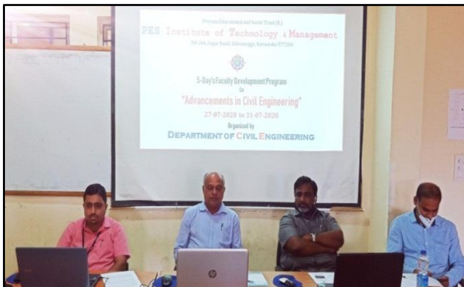
Inauguration of Five days FDP